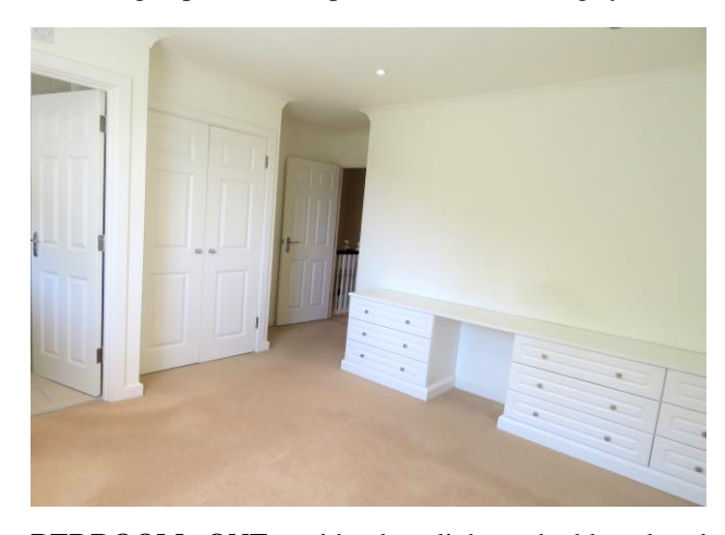
BEDROOM ONE : with downlights, double glazed window, radiator, large built in wardrobe, coved ceiling, fitted dresser unit with extensive drawers and surface.

LANDING with coved ceiling, downlights, loft access and airing cupboard with pressure water heating system.